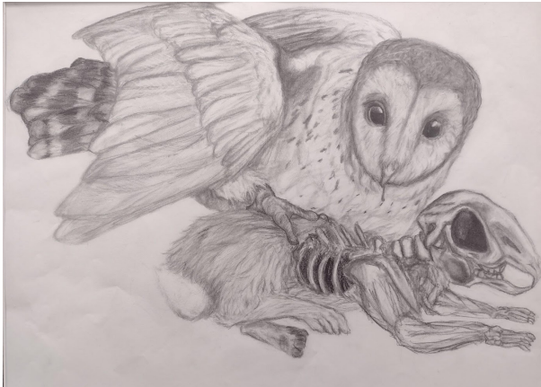
Ava Pineda, "Beauty School" Graphite Pencil Drawing